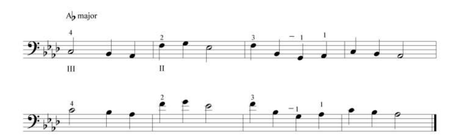
O D C Cello Studio